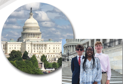
Washington Youth Tour: June 15-20, 2025

We've made it easy to apply for either FREE trip. Apply today!