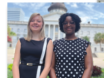
Cooperative Youth Summit: July 14-17, 2025