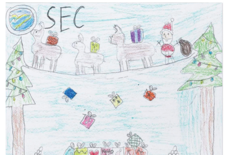
Leira Fivек of Pleasant Hill Elementary STREAM Academy.