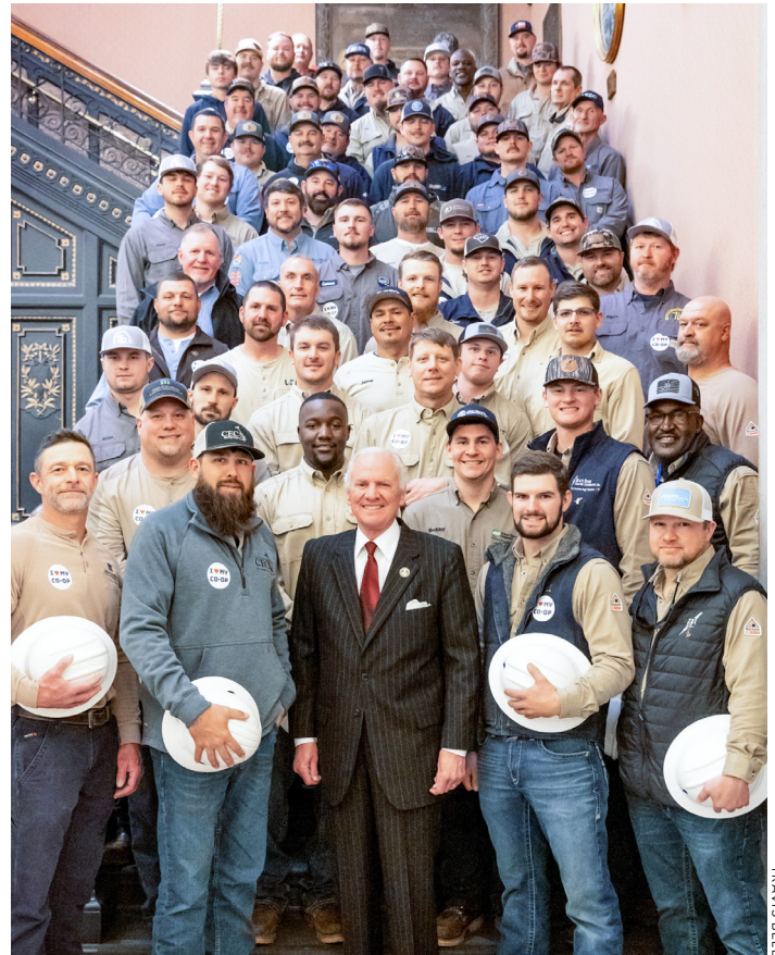
Linemen from electric cooperatives across South Carolina joined Gov. Henry McMaster on the staircase in the State House.

That work is critical again this year as the S.C. General Assembly considers energy policies that will determine how we