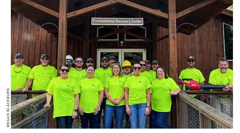
Eighteen SEC employees helped with the clean-up efforts at Lynches River